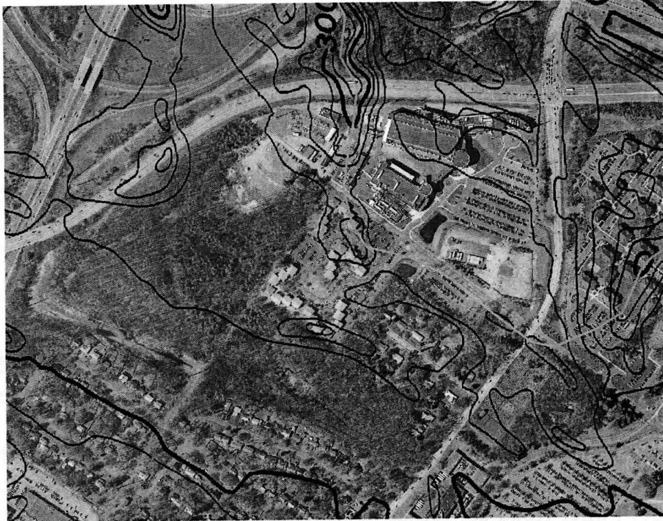
3- The CESTM area in 2001 (topo contours in black, watershed divider in tan)

NanoTech site---was the boundary line between the southern slope and the northern slope of the 96 acre University owned plot, only a small portion of which is occupied by NanoTech. The southern edge of these dunes of course directed the surface water to the south.