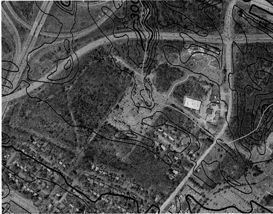
2- The CESTM area in 2001 (topo contours in black, watershed divider in tan)

surface water flowed away from the Tricentennial Drive towards the corner of Fuller and Washington Avenue Extension.